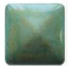
CCC-HE117 SEA SPRAY