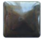
CCC-HE137 PARCHMENT BROWN