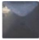
CCC-HE005 GUN METAL*