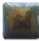
CCC-HE145 SEA AGATE