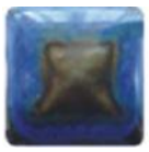
CCC-HE149 BLUE AGATE