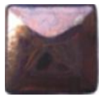
CCC-HE001 BROZEN METAL*

Chrysanthos High Fire Glaze is a range of glaze varieties aimed more at the sophisticated user. These glazes are specifically formulated for application to mid fire clays that are to be glaze fired to between cone 4 (1,186°C) and cone 6 (1,222°C). Generally, to obtain optimum results, 3 - 4 coats of the metallic glazes and 2 - 3 coats of the other glazes should be applied using a fully loaded brush. Ensure each coat is dry before applying subsequent coats at right angles to each other.