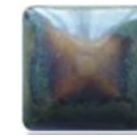
CCC-HE133 GREEN AGATE