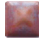
CCC-HE109 ORANGE ONYX