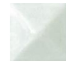
CCC-HF161 CLEAR DIPPING