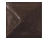
CCC-HF145 ANTIQUÉ BROWN