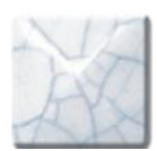
CCC-HE301 CRACKLE CLEAR