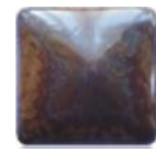
CCC-HE141 MARBLE BROWN