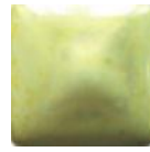
CCC-HE105 HONEY ONYX