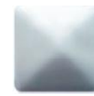
CCC-HE201 LOW SHEEN CLEAR